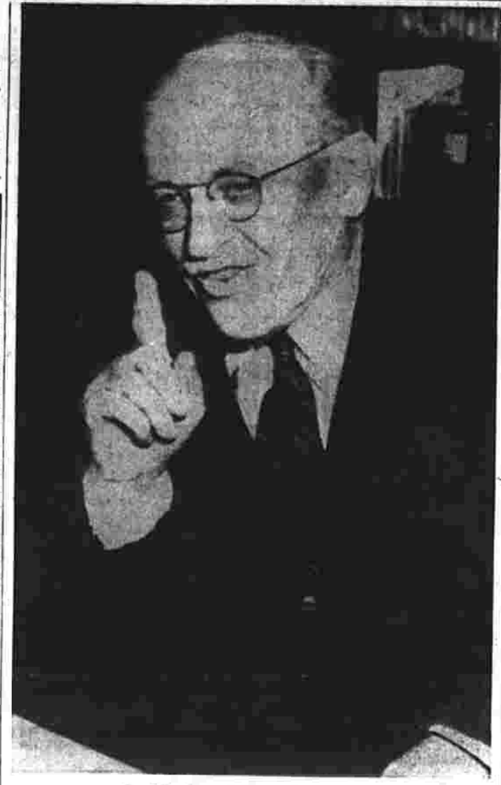
Sen. Ralph Flanders (R-Vt.) emphasizes a point as he talks with reporters at a news conference. He said the United States will not get its missile program into highest gear until President Eisenhower names a top boss with complete authority to act.

latest report from the Civil Scout Council records $2,340 received in their recent fund campaign. Largest contributors were: Exchange Club, $200; Lions Club $100; Connecticut Club, $50; Woodbridge Assn., $50; Service Club and Woman's Club, $25 each; and J. T. Slocum, $20.